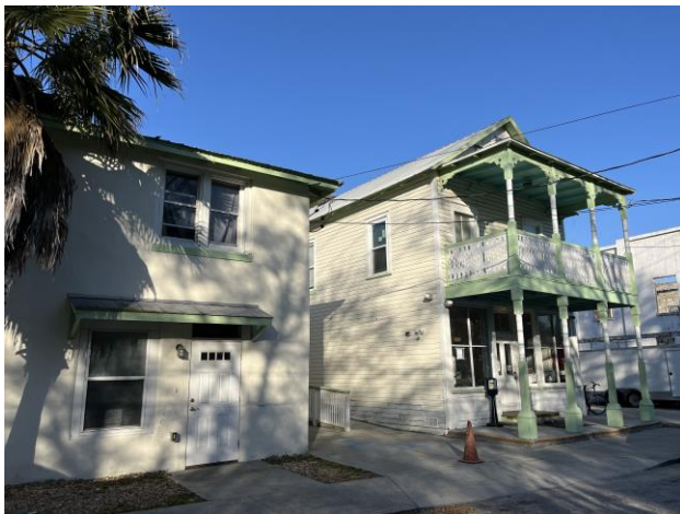
St Francis House and women's dorm building