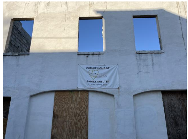
Future home of St Francis House family shelter