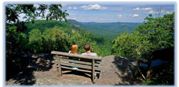
The view from Meditation Rock!