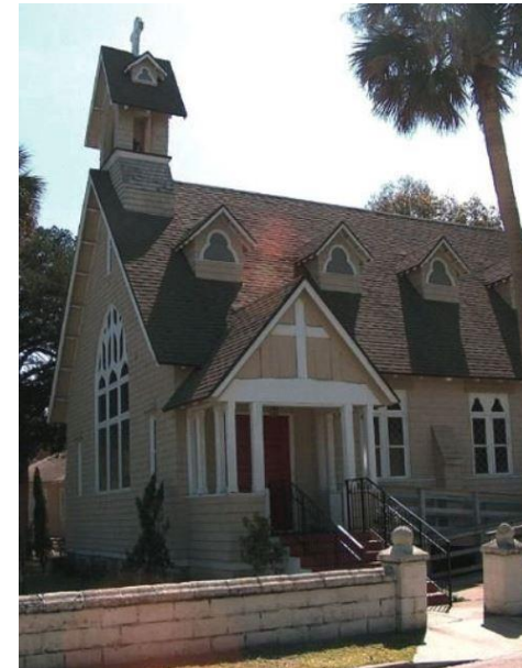
St. Cyprian's Episcopal Church